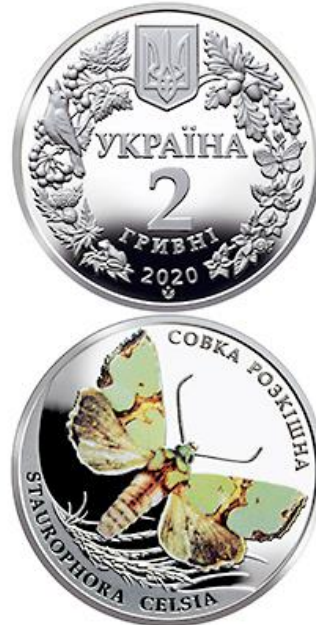
Figure 20. The Malachite Moth (gs) (NBU (2023a))