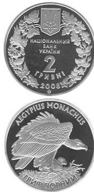
Figure 17. Eurasian Black Vulture (gs) (NBU (2023a))