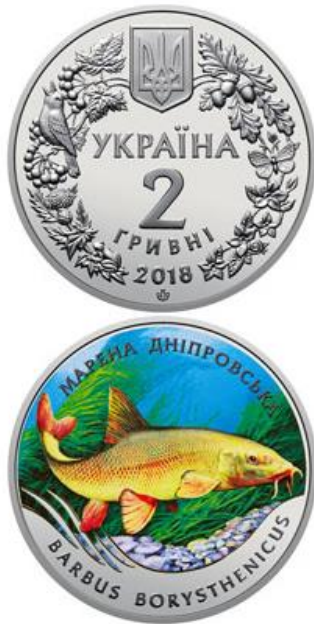
Figure 22. The Dnieper Barbel (gs) (NBU (2023a))