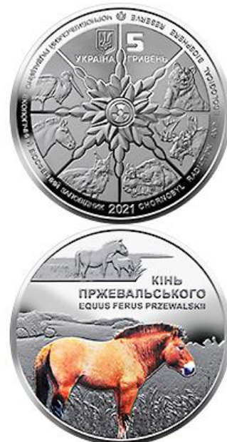
Figure 8. Chornobyl. Rebirth. Przewalski's Horse (gs) (NBU (2023a))