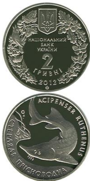
Figure 23. The Sterlet (gs) NBU (2023a) )