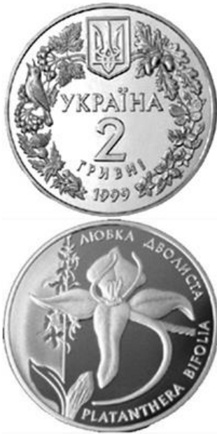
Figure 6. Butterfly Orchid (gs) NBU ((2023a))