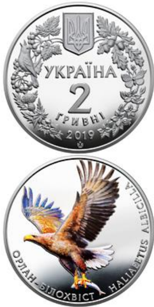
Figure 15. The White-Tailed Eagle (gs) (NBU (2023a))