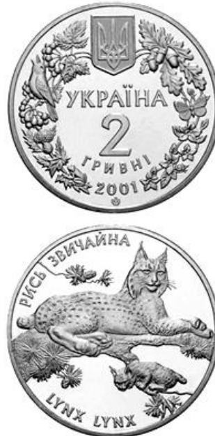
Figure 13. Lynx Lynx (gs) (NBU (2023a))