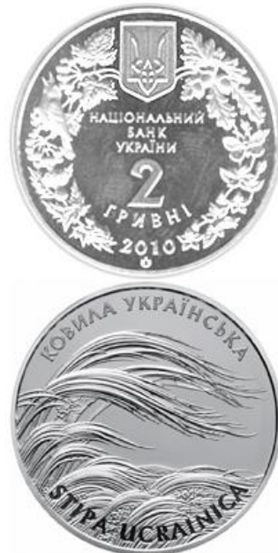
Figure 4. Stipa Ucrainica (gs) (NBU (2023a))