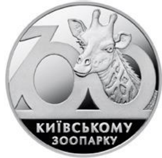
Figure 27. 100 Years to Kyiv Zoo (gs) (NBU (2023a))