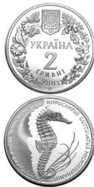
Figure 24. Seahorse (gs) (NBU (2023a))