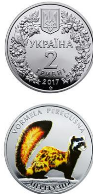
Figure 9. The Marbled Polecat (gs) (NBU (2023a))