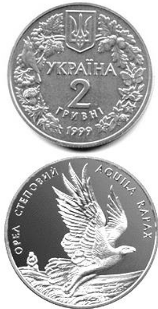
Figure 19. Steppe Eagle (gs) (NBU (2023a))