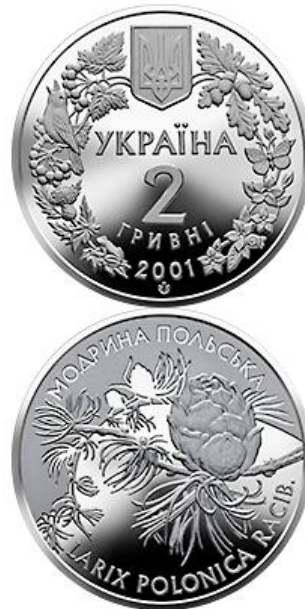
Figure 5. Polish Larch (gs) (NBU (2023a))