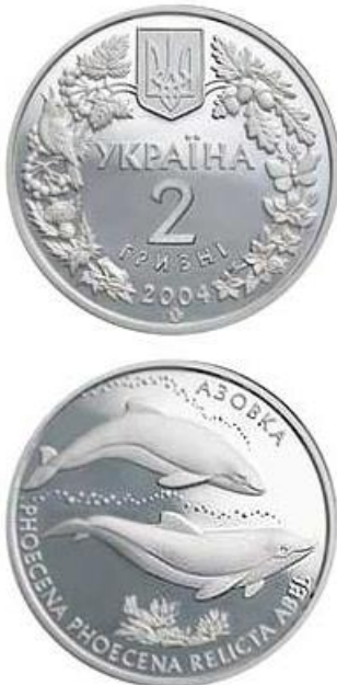
Figure 11. Azov Dolphin (gs) ( NBU (2023a))