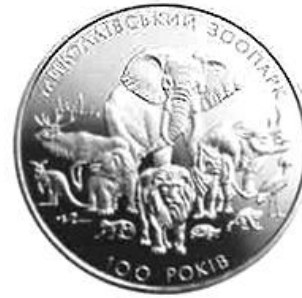
Figure 28. 100 Years of Mykolayiv Zoo (gs) (NBU (2023a))