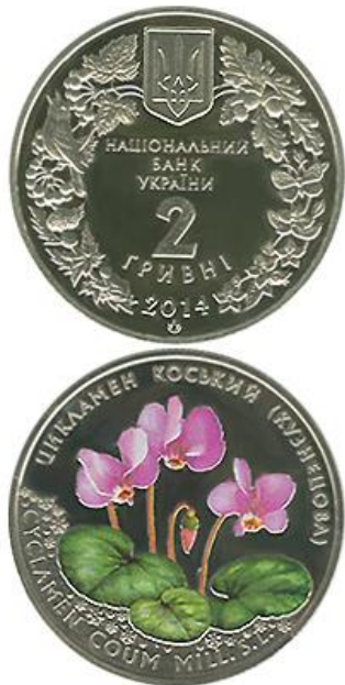
Figure 3. Cyclamen coum (Kuznetzovii) (gs) (NBU (2023a))