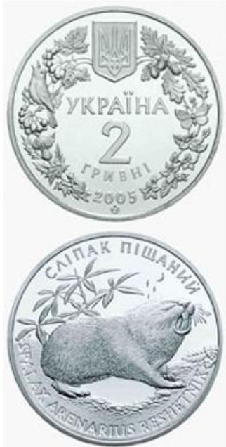
Figure 10. Spalax arenarius reshetnik (gs) (NBU (2023a))