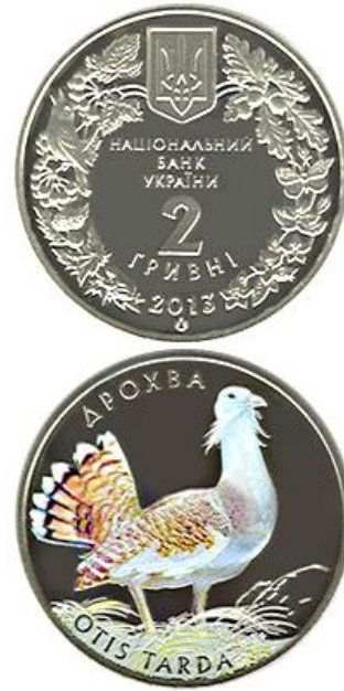
Figure 16. The Great Bustard (gs) (NBU (2023a))