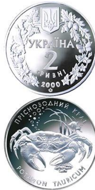
Figure 25. Freshwater Crab (gs)(NBU(2023a))