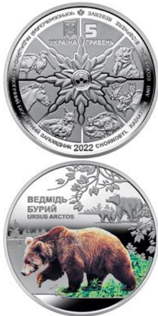
Figure 7. Chornobyl. Rebirth. The Brown Bear (gs) (NBU (2023a))