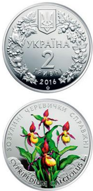
Figure 2. Lady's Slipper Orchid (gs) (NBU (2023a))