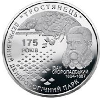
Figure 26. 175 years of the State Arboretum "Trostianets" (gs)(NBU (2023a))