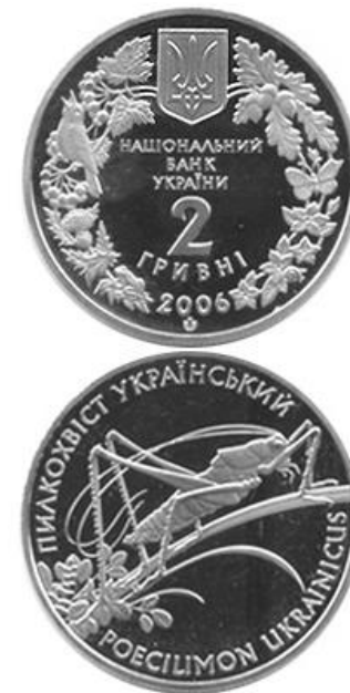
Figure 21. Ukrainian Bush Cricket (gs) (NBU (2023a))