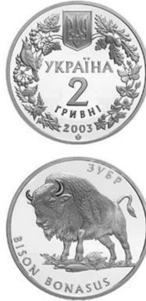
Figure 12. Bison Bonasus (gs) (NBU (2023a))