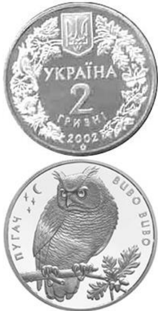
Figure 18. Eagle Owl (gs)(NBU (2023a))