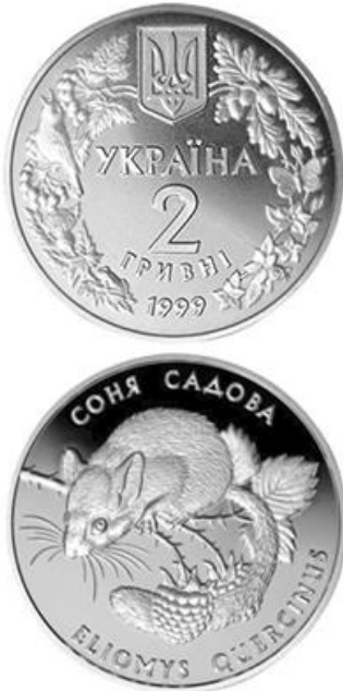
Figure 14. Garden Dormouse (gs) (NBU (2023a))