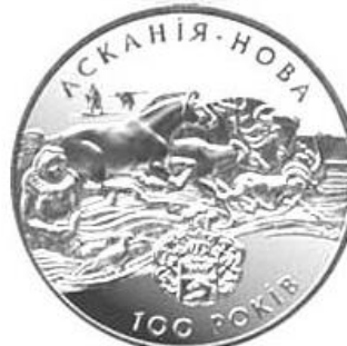
Figure 29. Askania-Nova (gs) (NBU(2023a))

Note that in order to avoid duplication of similar images on german silver and silver coins, only german silver coins are shown in the illustrations, as some of them have colored elements ( Fig. 2–28 ).